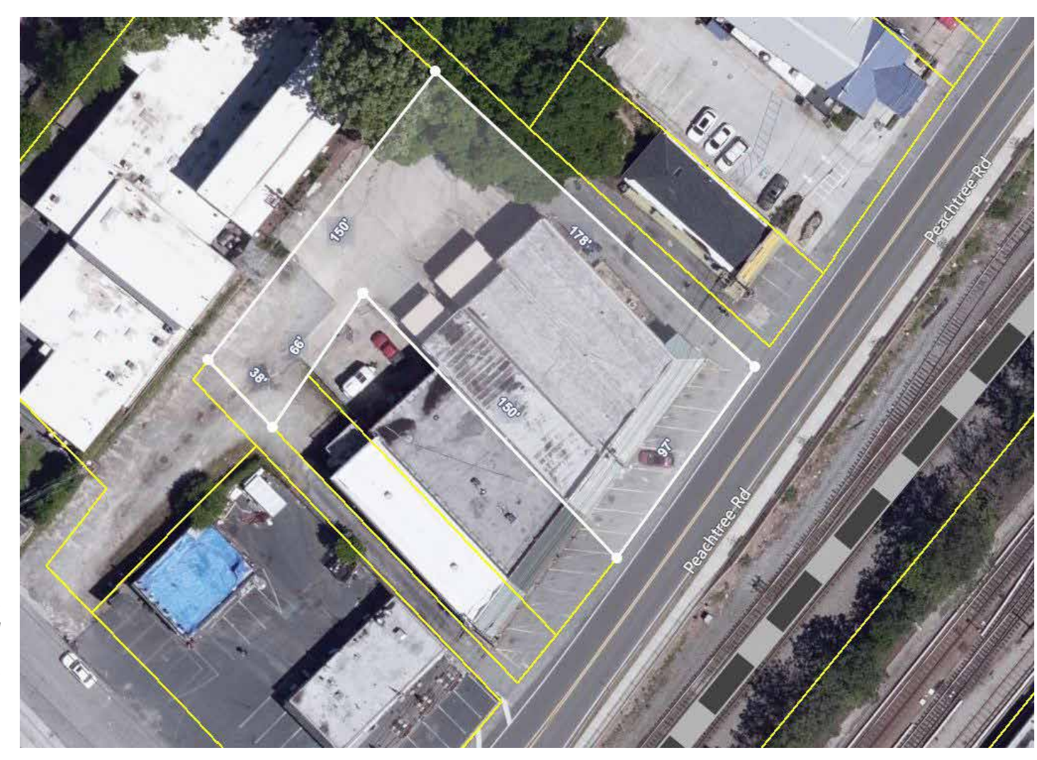
* Please note that this site plan was obtained from county GIS data. Actual property lines may differ substantially.